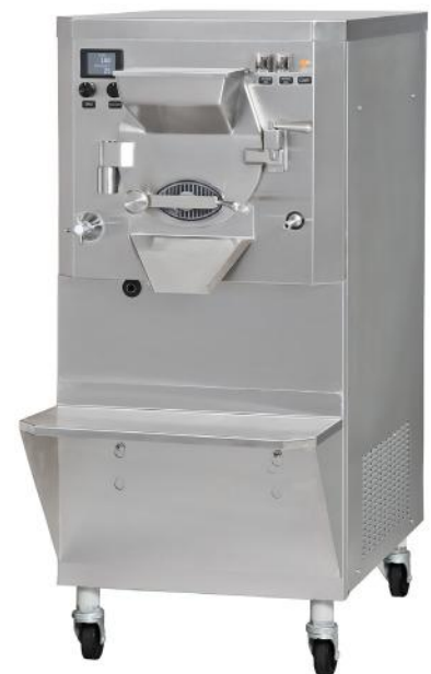
Shown With Optional Controls

*Excludes normal wear parts, see warranty card for details.