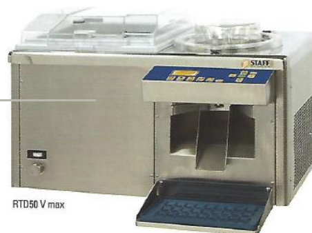
RTD50 V max