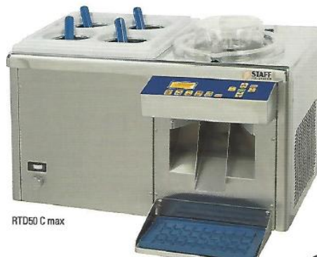
RTD50 C max