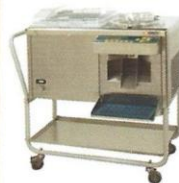
Carrello su richiesta Trolley on request