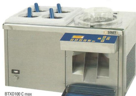
BTXD100 C max