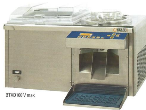
BTXD100 V max