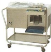
Carrello su richiesta Trolley on request