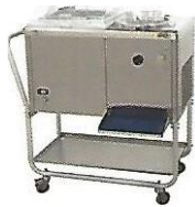
Carrello su richiesta Trolley on request