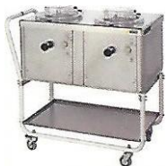
Carrello su richiesta Trolley on request